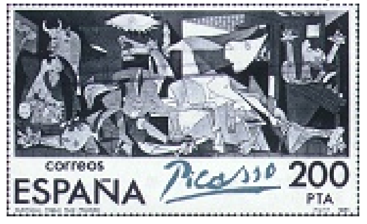
Almost the exact size of the stamp

While thumbing through pages in a Stratford Stamp Club circuit book at a Kincardine Club show almost 20 years ago now, I came across a gigantic (49mmX82mm or nearly 2"X3.25") stamp issued by Spain in a souvenir sheet, Scott #2252, on October 25, 1981. The instant I saw it, I involuntarily let out a derisive laugh. I had little respect for it thanks to its sheer size and neither did my fellow collectors sitting at the Stratford tables. I bought it anyway, however, even though I do not collect Spanish stamps, joking that the kid in me just had to have a stamp this big!