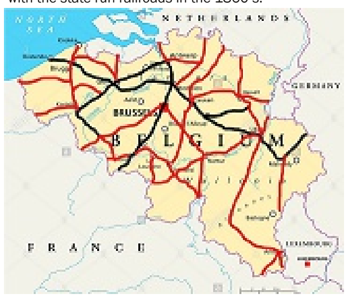
Belgian Rail System of 1866 (G. Redner)

King Leopold 1 was the first king of the country. He is credited with great vision and started a railroad system which by 1843 connected the major cities within the country. Using public and private means Belgium had the densest rail system in Europe with approximately 4,300 miles of track crisscrossing the country. Eventually the private railroads were amalgamated with the state-run railroads in the 1860's.