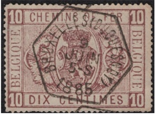
post office. Parcel Post Stamp Scott # Q1 (G. Redner) Note the hexagonal had a different cancel.

Once the parcel post system was established, it needed to be melded with the postal system, so a parcel could be sent from the railway station, a telegraph office, or a post office.